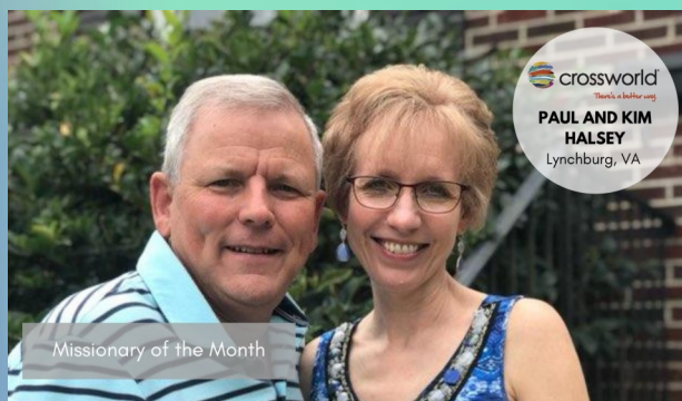
Missionary of the Month

MONTHLY NEWSLETTER | MCCOY MEMORIAL BAPTIST CHURCH | AUGUST 2021 134 ST. CLAIR AVE. | ELKHART, IN 46516 | OFFICE PHONE: 574-294-1131